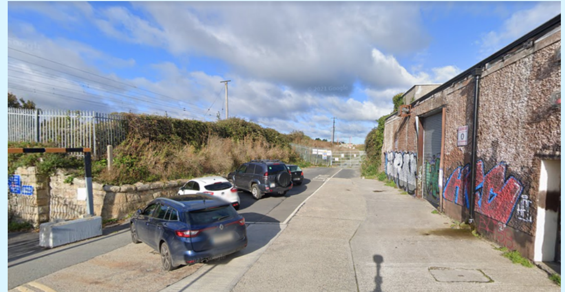
Figure 2 - Start of proposed route