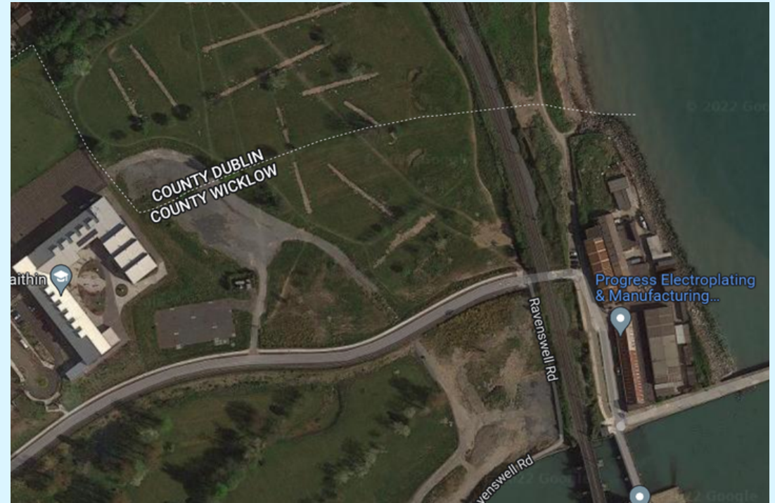
Figure 1 - Project Location Map